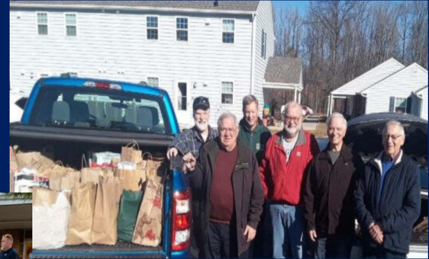
DE: Kofc 2023 Souper Bow collected almost 12,000 lbs. of food for local pantries.