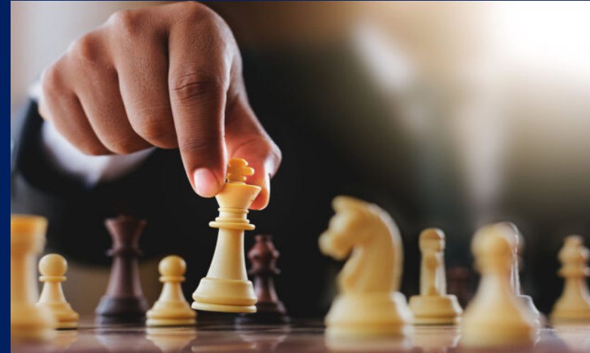
DE: Knights of Columbus crown champions in 18 th Annual Youth Chess tournament.