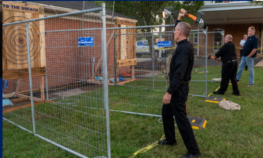
MD: Men of the Chesapeake Council fling axes in Anne Arundel County to step up faith.