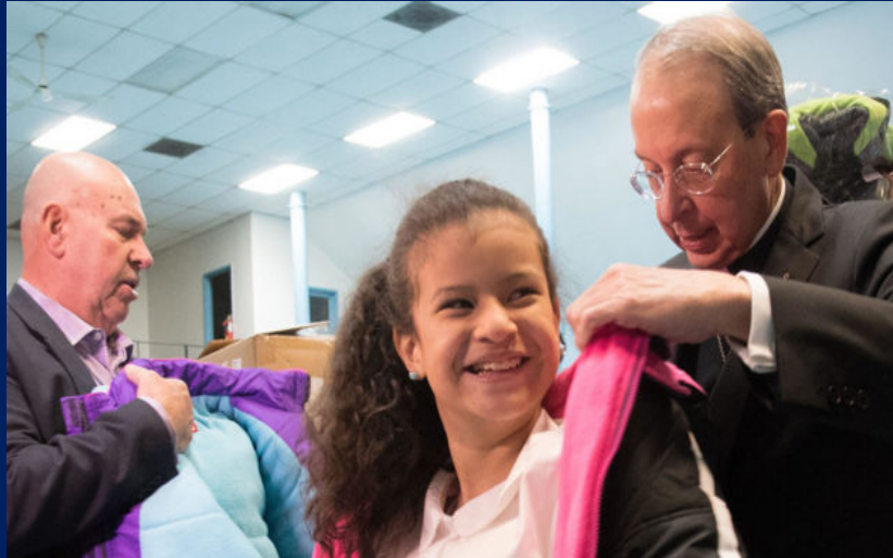
MD: Knights of Columbus warm Baltimore students with 1,000 coats.