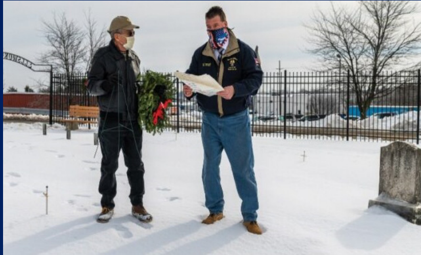
MD: Glory Restored: Local Kofc refurbish historic African American Cemetery.