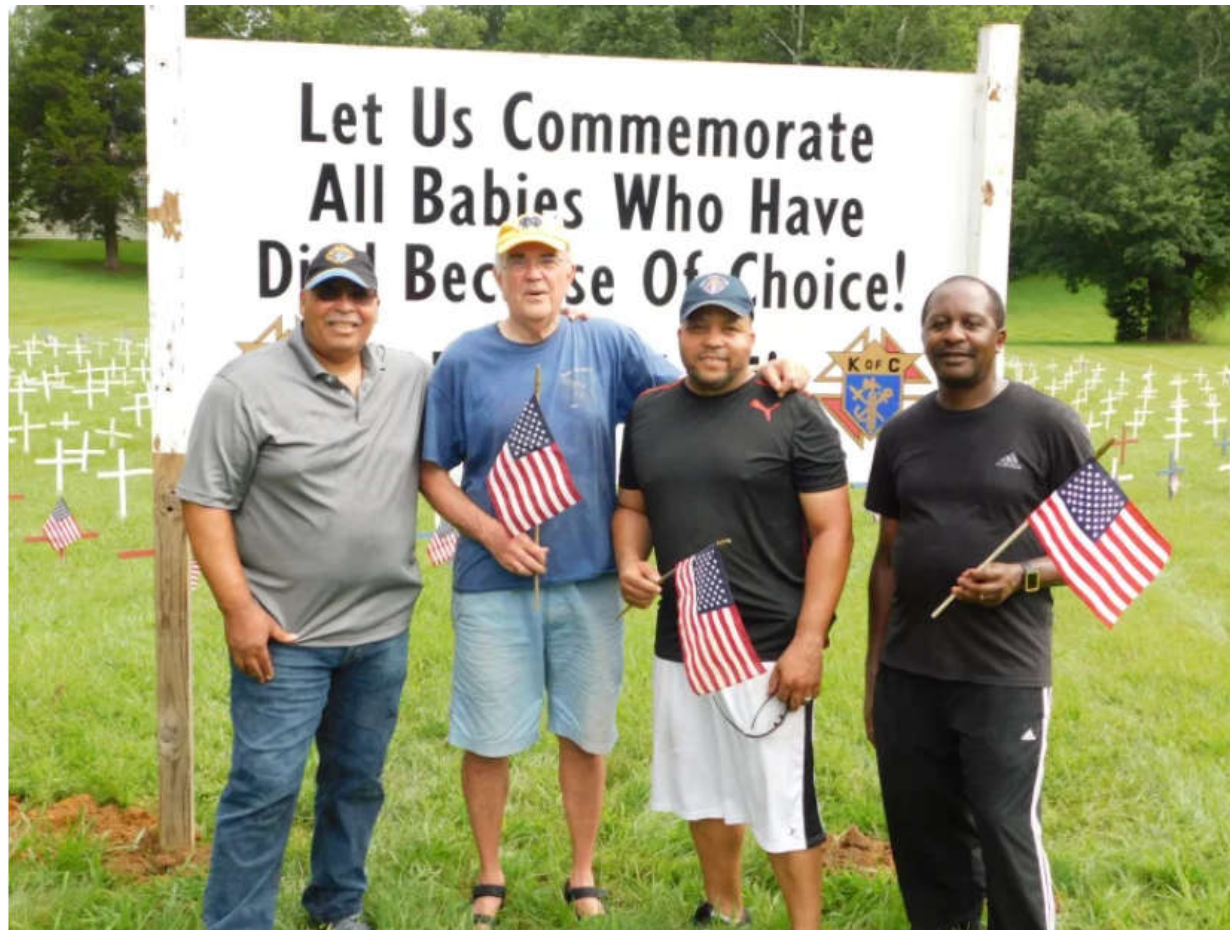
Michael C. Kidd Council, Holy Family Church, Mitchellville, MD