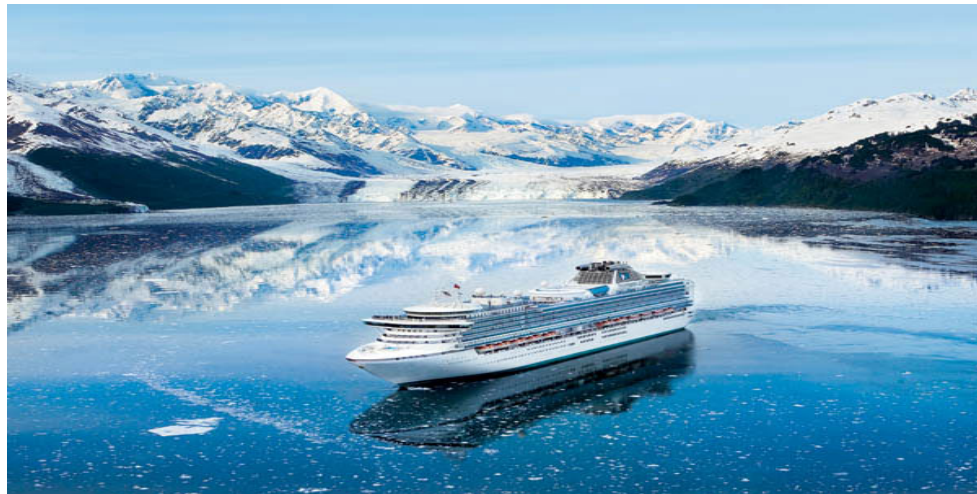
Ocean View Staterooms

3 Night Land Tour – Fairbanks (2 nights) and Denali 7 Night Cruise – Southbound Alaska